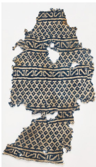
A fragment of knitting, possibly remains of a sock, in blue and white cotton. Victorian & Albert Museum, ca. 1100 – 1300 CE.

In the Middle Ages, knitted fabrics and clothes were produced by guilds, which operated across Europe. These guilds were composed of men who had refined this ancient craft and were producing exquisite fabrics from silk and cotton for the nobility of the day. The world of knitting eventually developed and expanded as a trade.